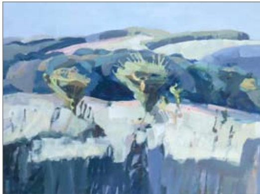
Summer Cornfields and Downs II Mixed Media on Board 126 x 95cm