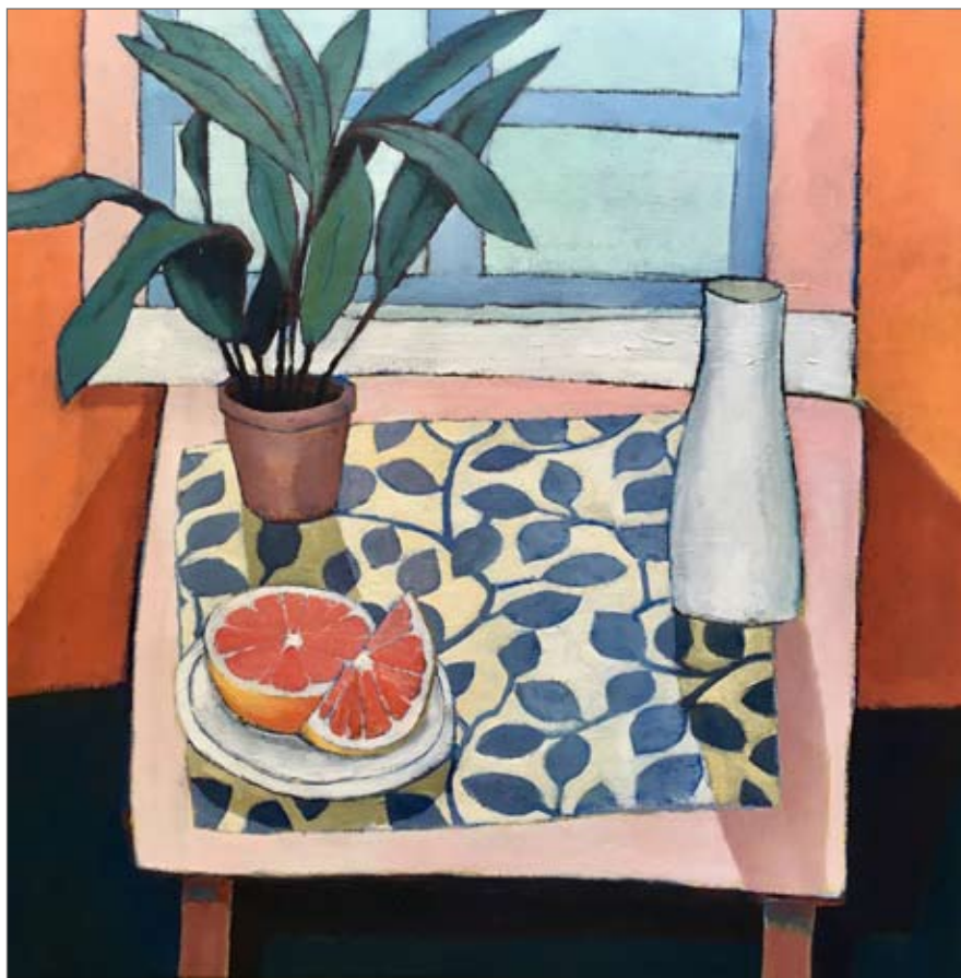
Still Life with Carafe and Pink Grapefruit Oil on Canvas 60 x 60cm