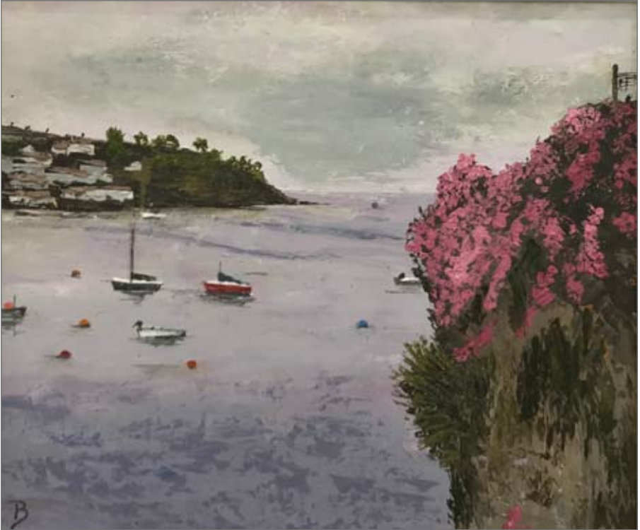
Out to Sea from Fowey Oil on Board 27 x 23cm