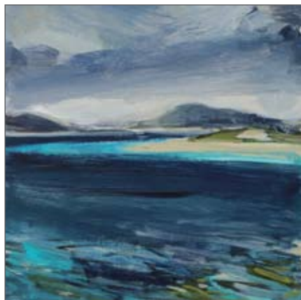
Bright Beach Harris Acrylic on Gesso Panel 40 x 40cm