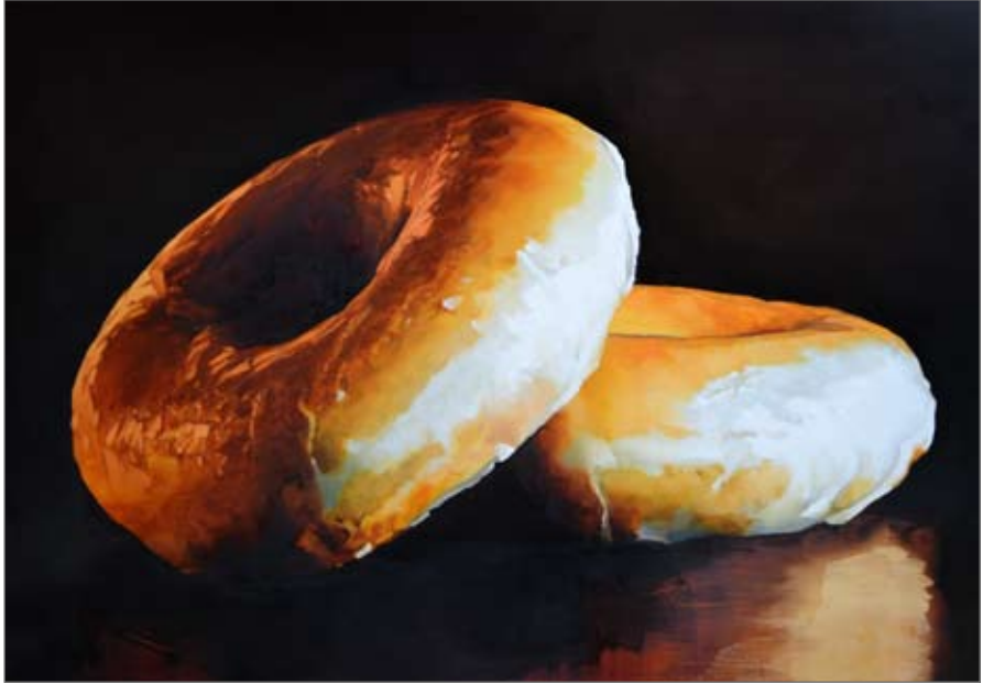
Aphrodite and Adonis Oil on Wood Panel 70 x 100cm