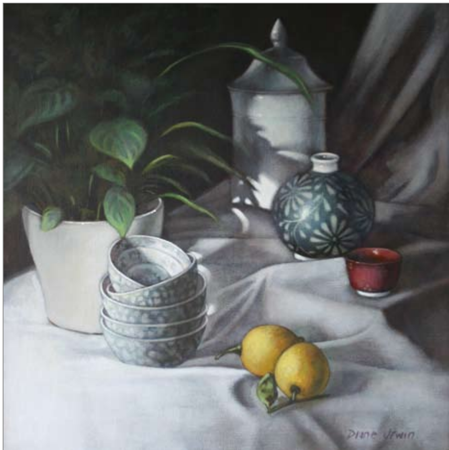
Sunlight Acrylic on Canvas 84 x 63cm