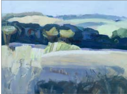
Summer Cornfields and Downs I Mixed Media on Board 126 x 95cm