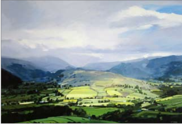
High Rigg from Blease Fell Acrylic on Canvas 20 x 30in