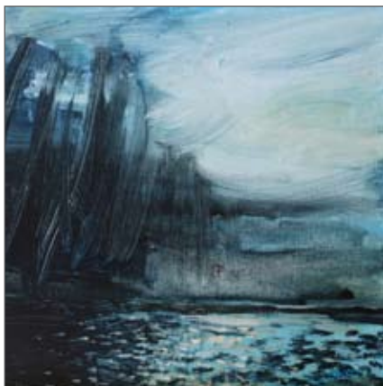
Rainburst Over The Sea Acrylic on Gesso Panel 48 x 47cm

Jane has recently relocated from the East Midlands to Fife in Scotland and her studio now has a sea view, inspiring new and dynamic work. Jane likes to sketch on location and travels widely, later working from sketchbooks, photographs and memory and using a range of media on gesso wooden panels, canvas and paper. Her paintings are informed by her personal experience of walking in the landscape, and the sense of being out in big open places lies at the heart of what she seeks to express.