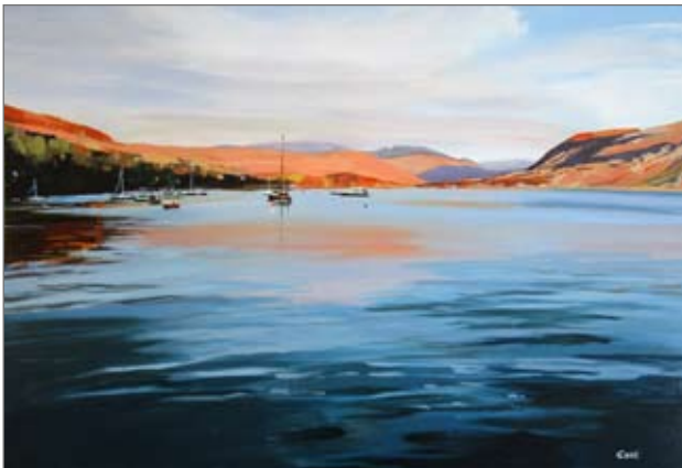
Loch Broom at dusk, Ullapool Acrylic on Canvas 20 x 30in