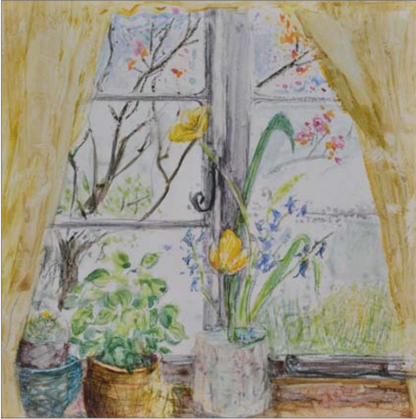
Cottage Window Watercolour 15 x 15cm

Dorothea Carr works in both oil and watercolour. She has long been fascinated with the sea, and her washy, ambient seascapes are filled with light and expression, using the paint to convey a feeling of peace and simultaneously energy. Her still life work is characterised by delicate brushwork and an almost oriental feeling for colour and space, bringing the domestic scene; the windowsill, the potted plant, to life with an understated ease and appreciation of composition and colour.