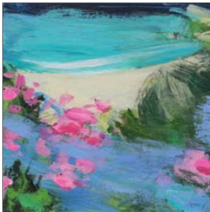
Turquoise Sea Spring Wildflowers Acrylic on Gesso Board 21 x 21cm